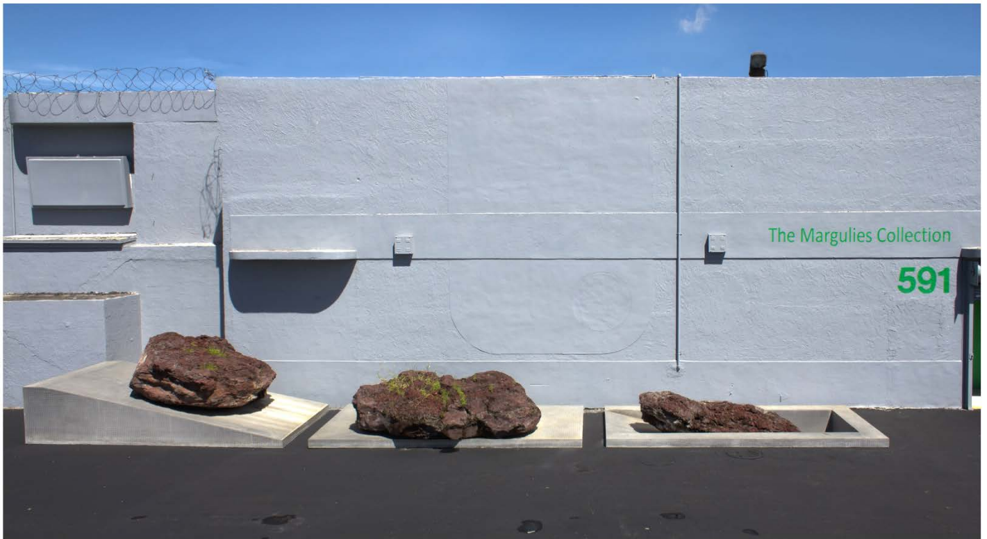
Michael Heizer Elevated, Surface, Depressed , 1969-81 Volcanic rock, scoria, and diamond-plate aluminum pedestals 72 x 633 x 96 inches Collection Martin Z. Margulies