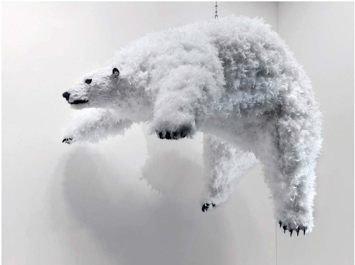
Paola Pivi Too late, 2017 Urethane foam, plastic, feathers 65 x 71 ¾ x 92 ½ inches Collection Martin Z. Margulies