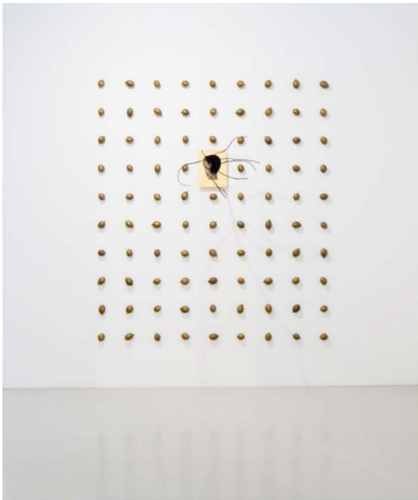
Mimmo Paladino Senza titolo , 2011 Mixed media on wood, aluminum, brass 122 x 98 7/16 x 51 3/16 inches Collection Martin Z. Margulies