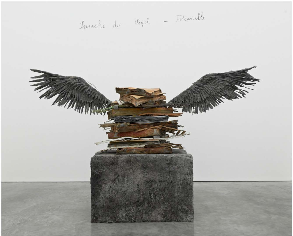
Anselm Kiefer Sprache der Vögel , 1989 Lead, steel, wood, oil, plater, resin and acrylic 114 3/16 x 194 1/8 x 66 15/16 inches Collection Martin Z. Margulies