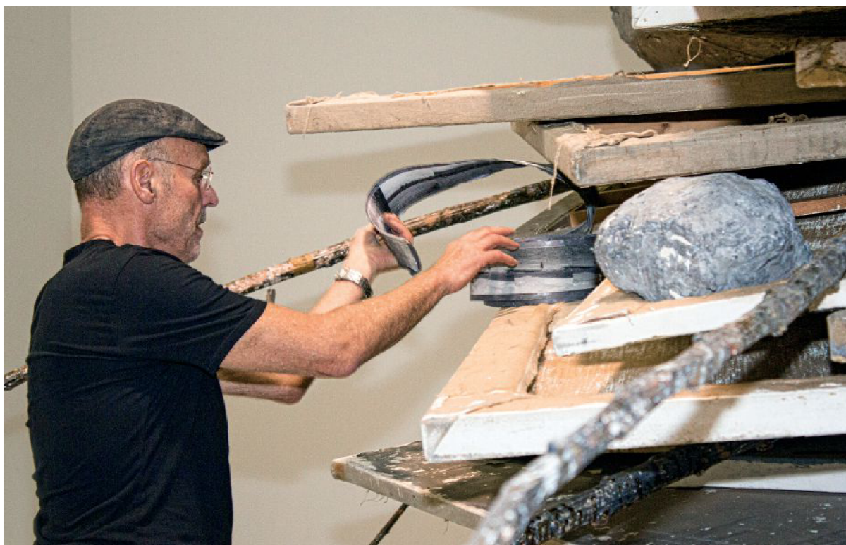
JEANIE AMBROSIO / COLLECTION MARTIN Z. MARGULIES