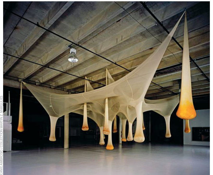
JEANIE AMBROSIO / COLLECTION MARTIN Z. MARGULIES