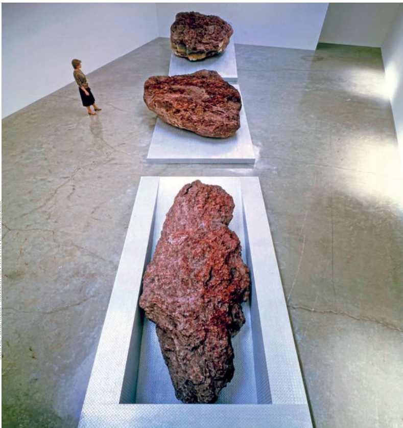
JEANIE AMBROSIO / COLLECTION MARTIN Z. MARGULIES